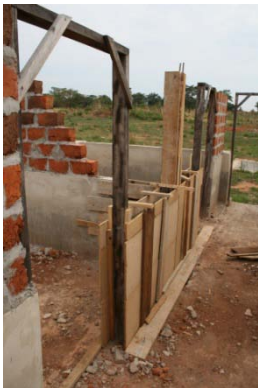
17 Boarding Boys 1. Reinforced foundation for the weight of the interior brick walls (↓).