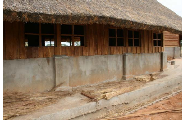
10 Computerroom. Assembled and fixed all the window frames (↑).