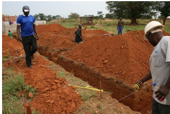
18 Boarding boys 2. Finished digging the foundation hole (↑).