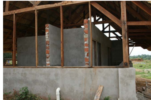
14 Administration 2. Finished ring beam, interior masonry and plastering inside walls (↑).