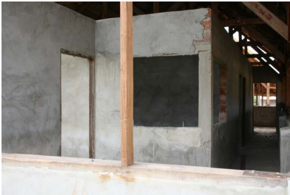
13 Administration 1. Finished ring beam, interior masonry and plastering inside walls (↓).